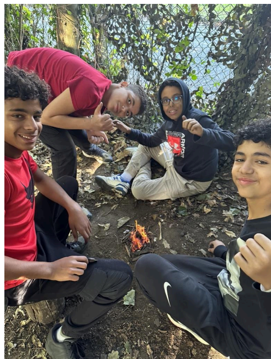
Survival Skills UK