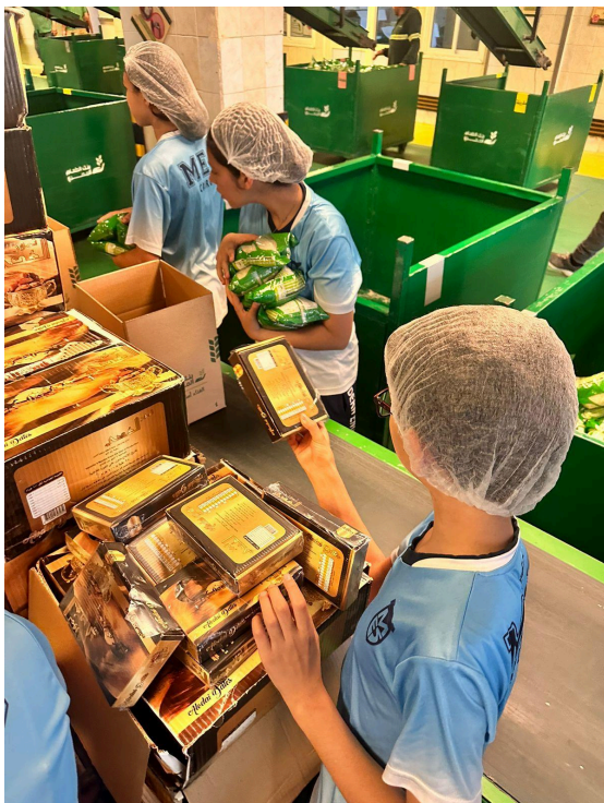
Egyptian Food Bank

Participation in Week Without Walls is a privilege offered to all students who meet the academic and behavioral requirements. Each year, teachers strive to find new and innovative opportunities for their students outside of the classroom. It is truly one of the highlights of the year for students as they can take a 'hands-on' approach to their learning and come away with invaluable experiences that will influence them for years to come.